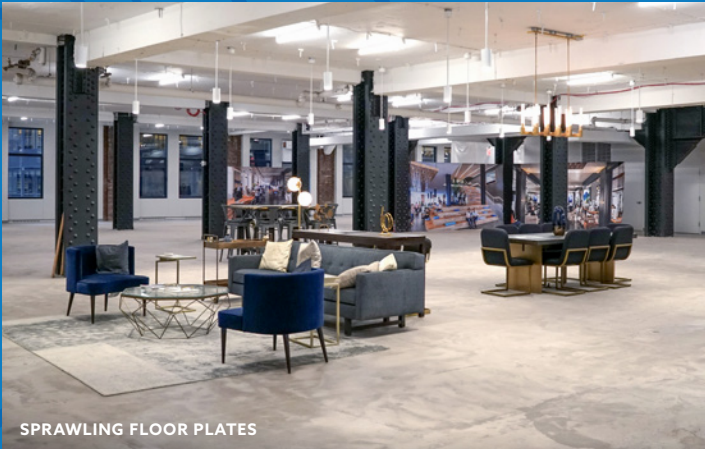
SPRAWLING FLOOR PLATES