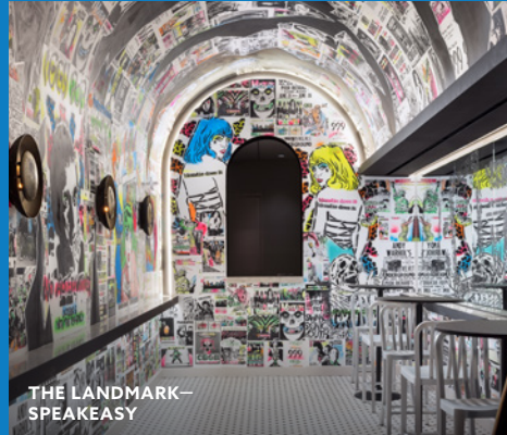
THE LANDMARK— SPEAKEASY