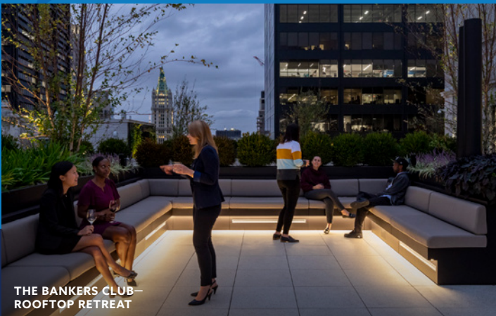
THE BANKERS CLUB— ROOFTOP RETREAT