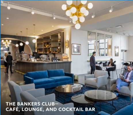
THE BANKERS CLUB— CAFÉ, LOUNGE, AND COCKTAIL BAR