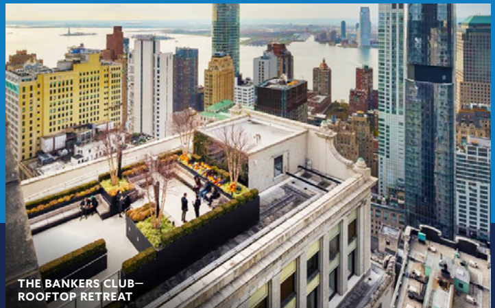
THE BANKERS CLUB— ROOFTOP RETREAT