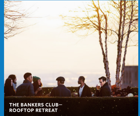
THE BANKERS CLUB— ROOFTOP RETREAT