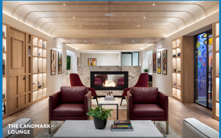
THE LANDMARK— LOUNGE